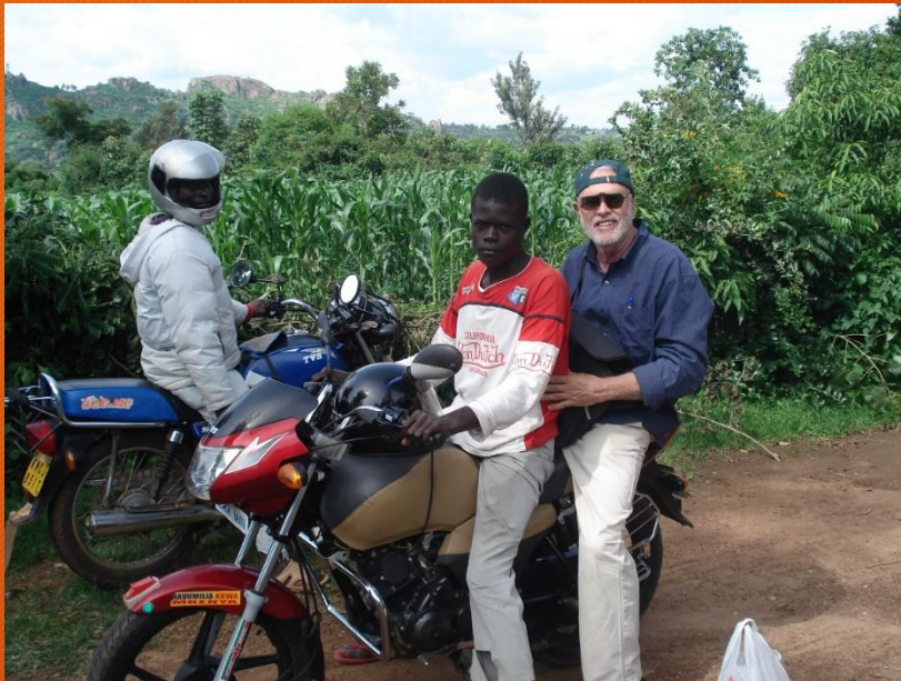
Founder on Boba Boda (motor bike)